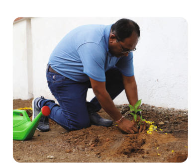
Tree Plantation- Jun – 2022